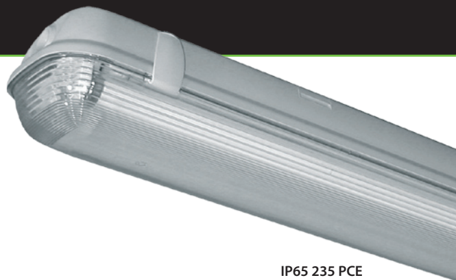
IP65 235 PCE